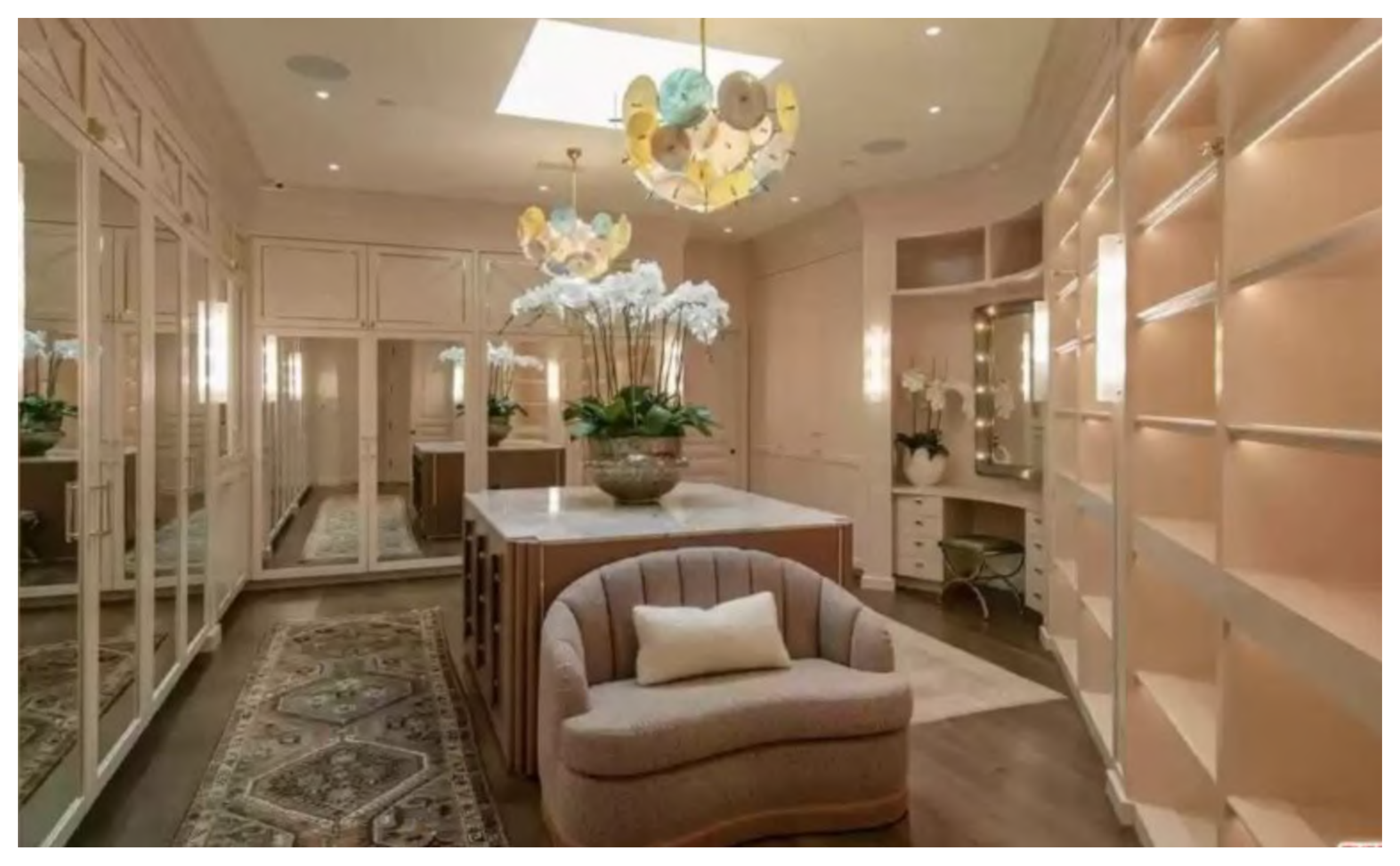
Diva-worthy closet