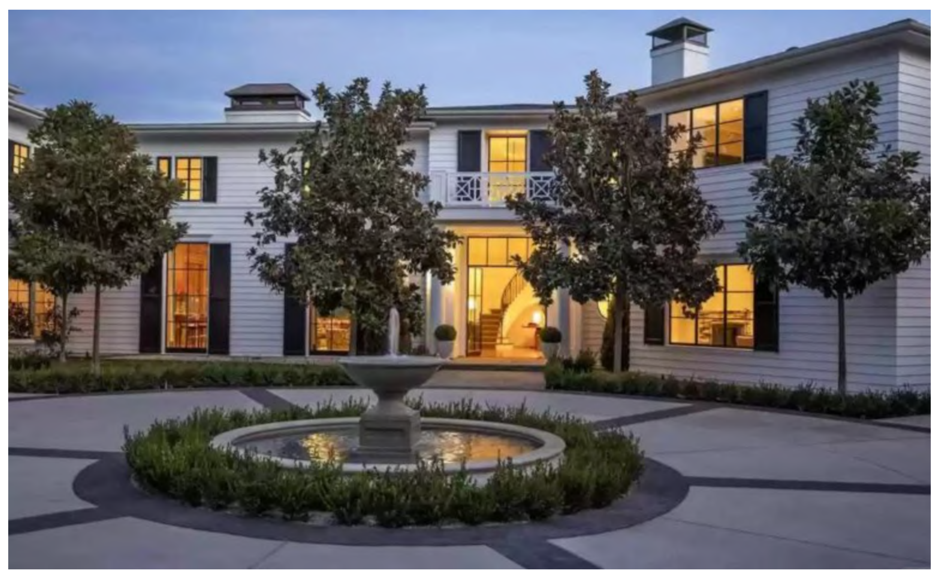
Traditional estate