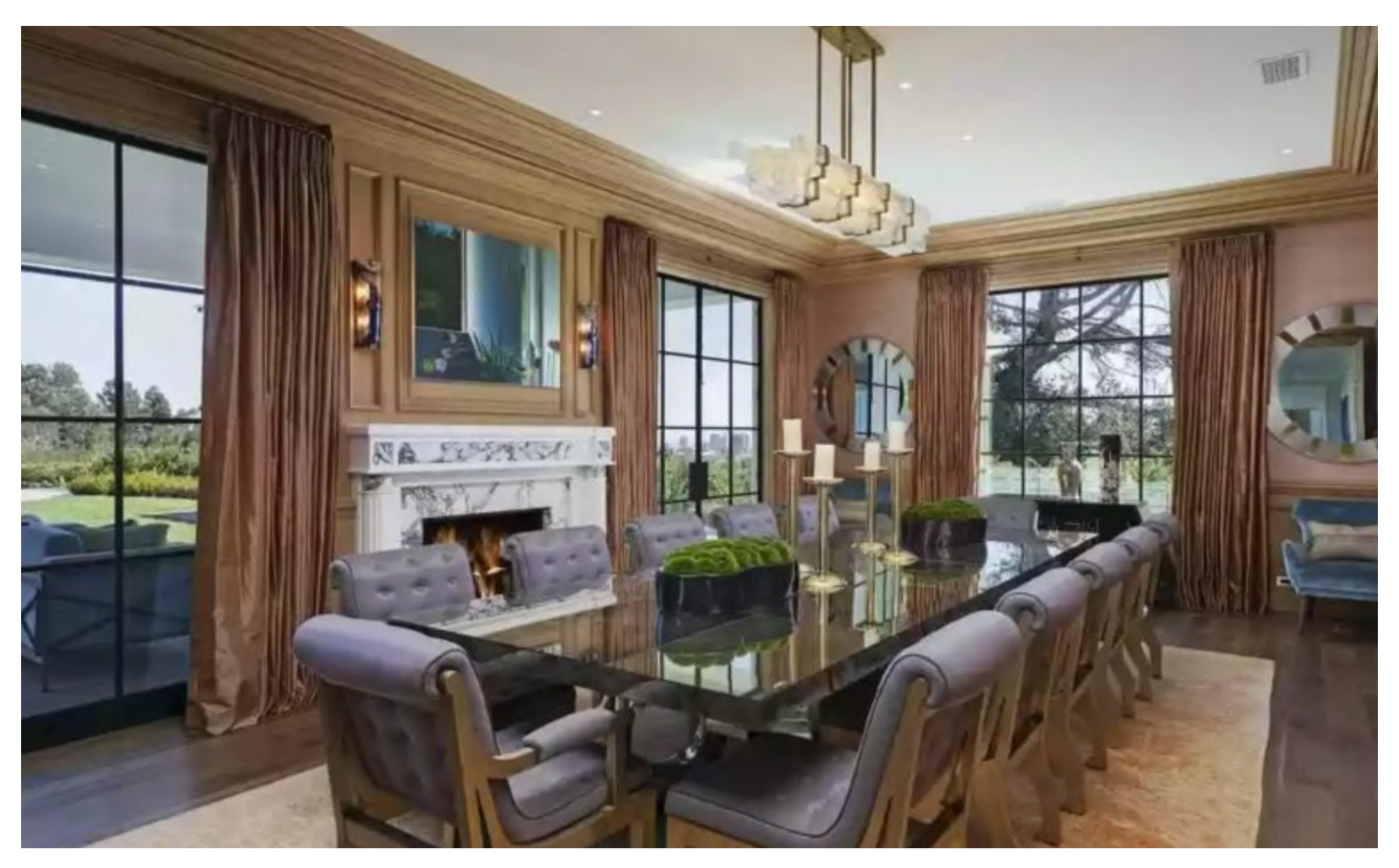
Dining room