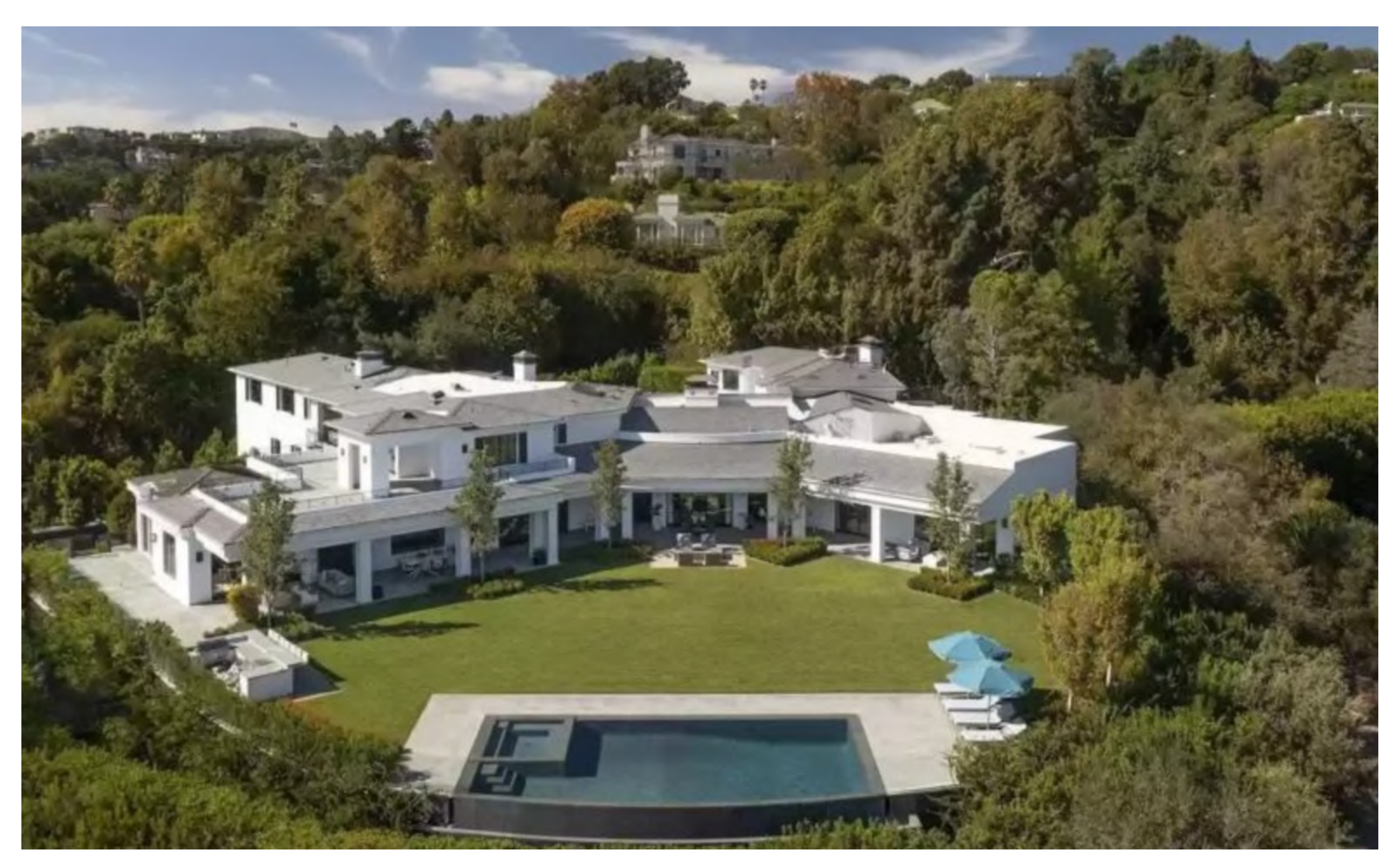
Scenic estate