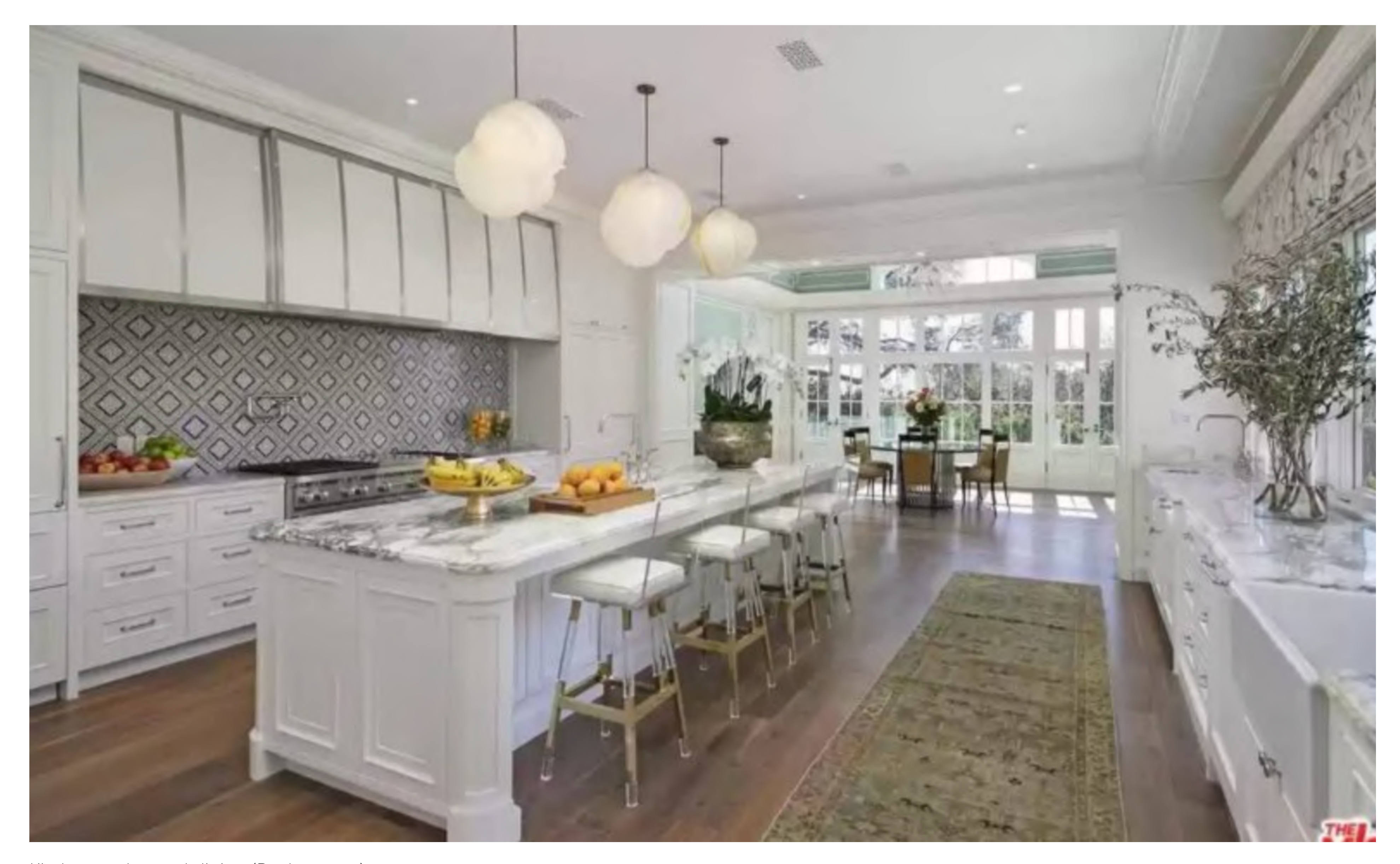
Kitchen and casual dining