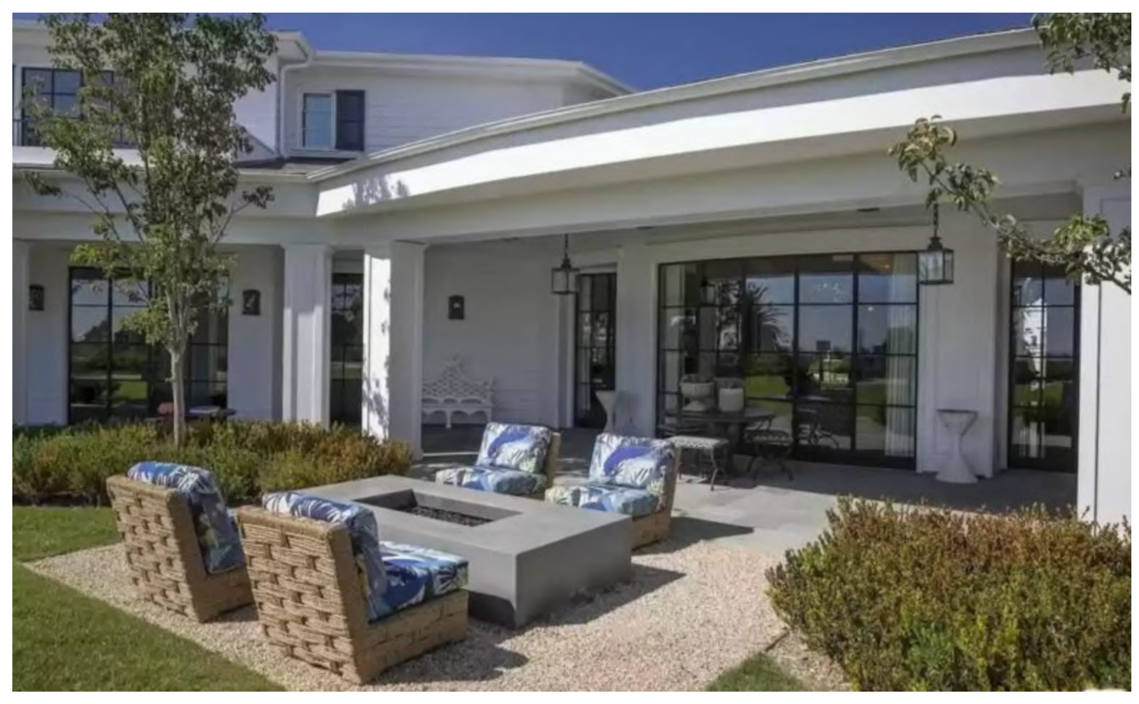
Outdoor seating and fire pit