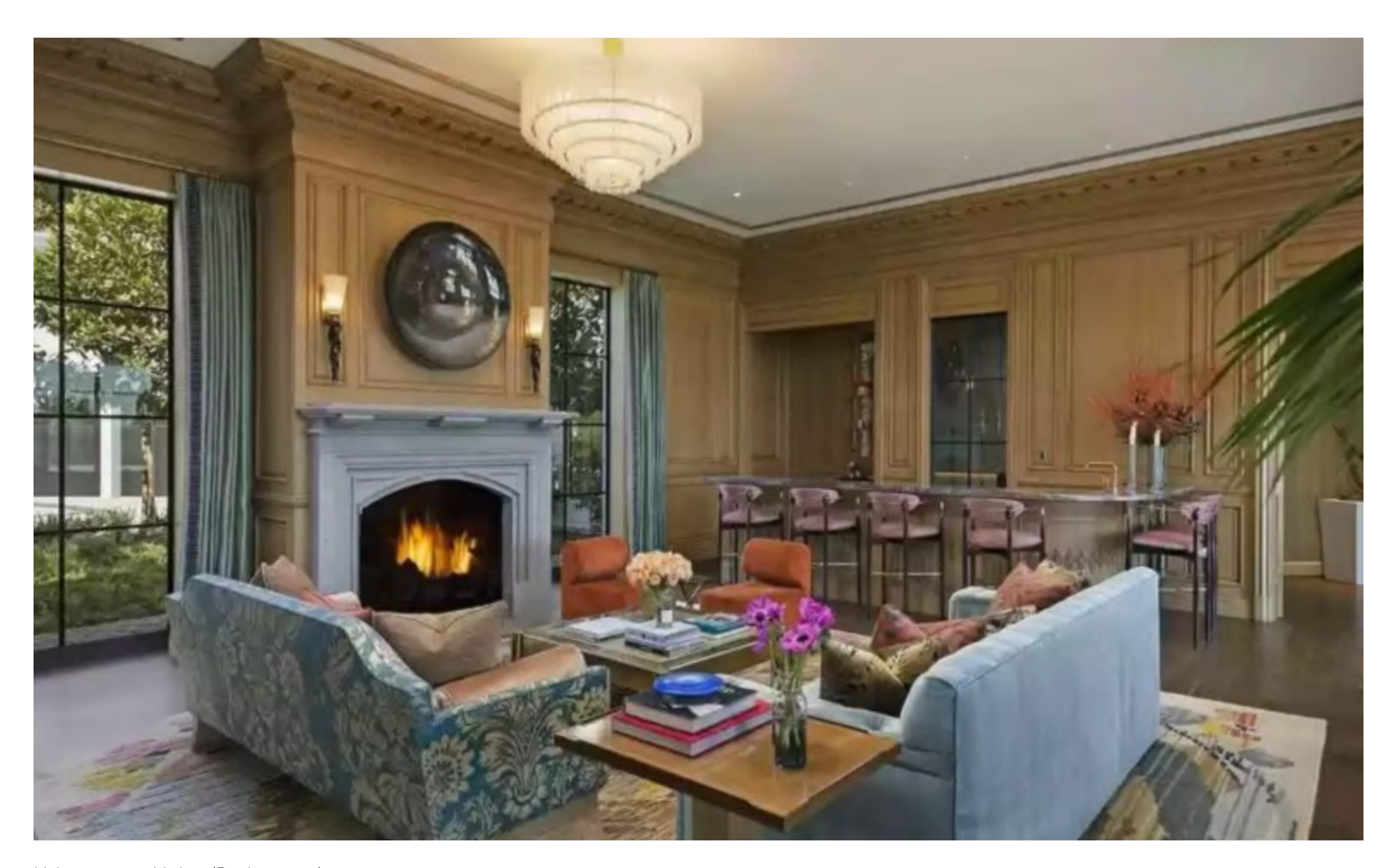
Living room with bar (Realtor.com)