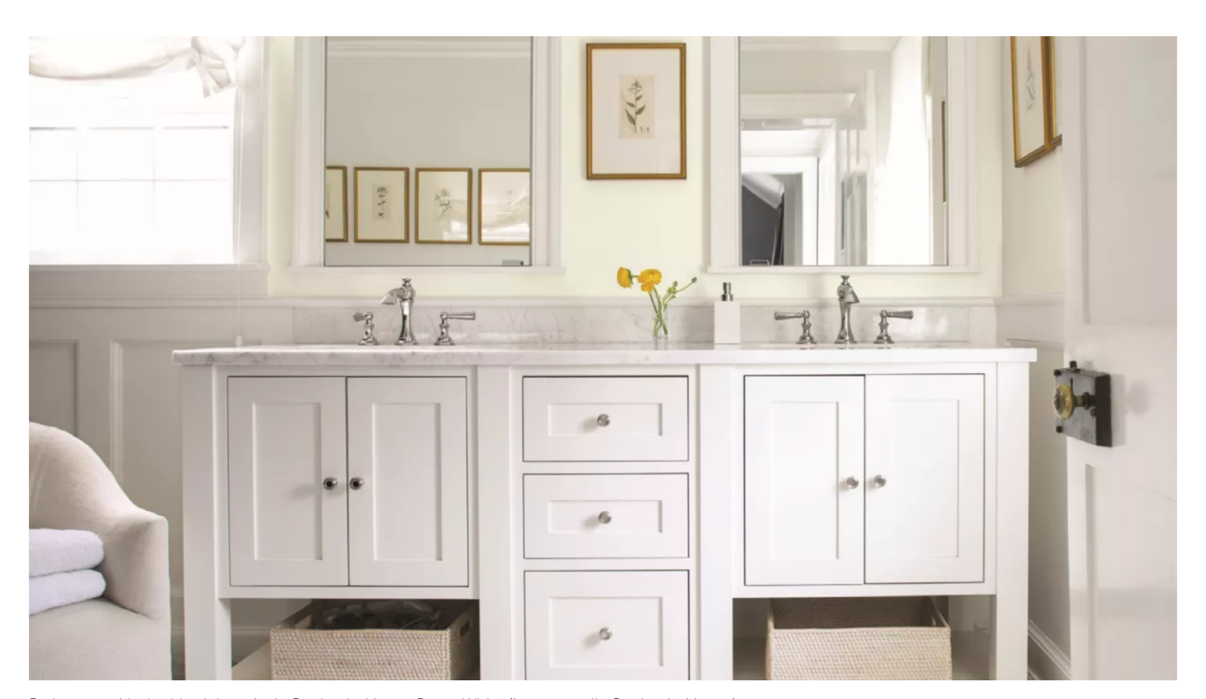
Bathroom with double sink vanity in Benjamin Moore Paper White

Anna Cottrell | June 13, 2021 <u>Link to original article.</u>